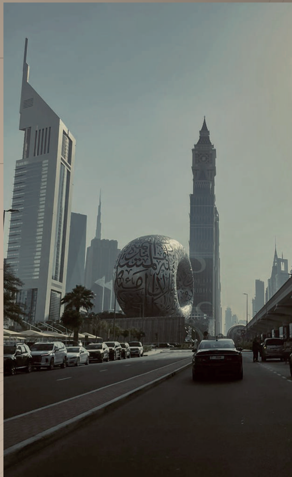
Trade Centre, Dubai, United Arab Emirates