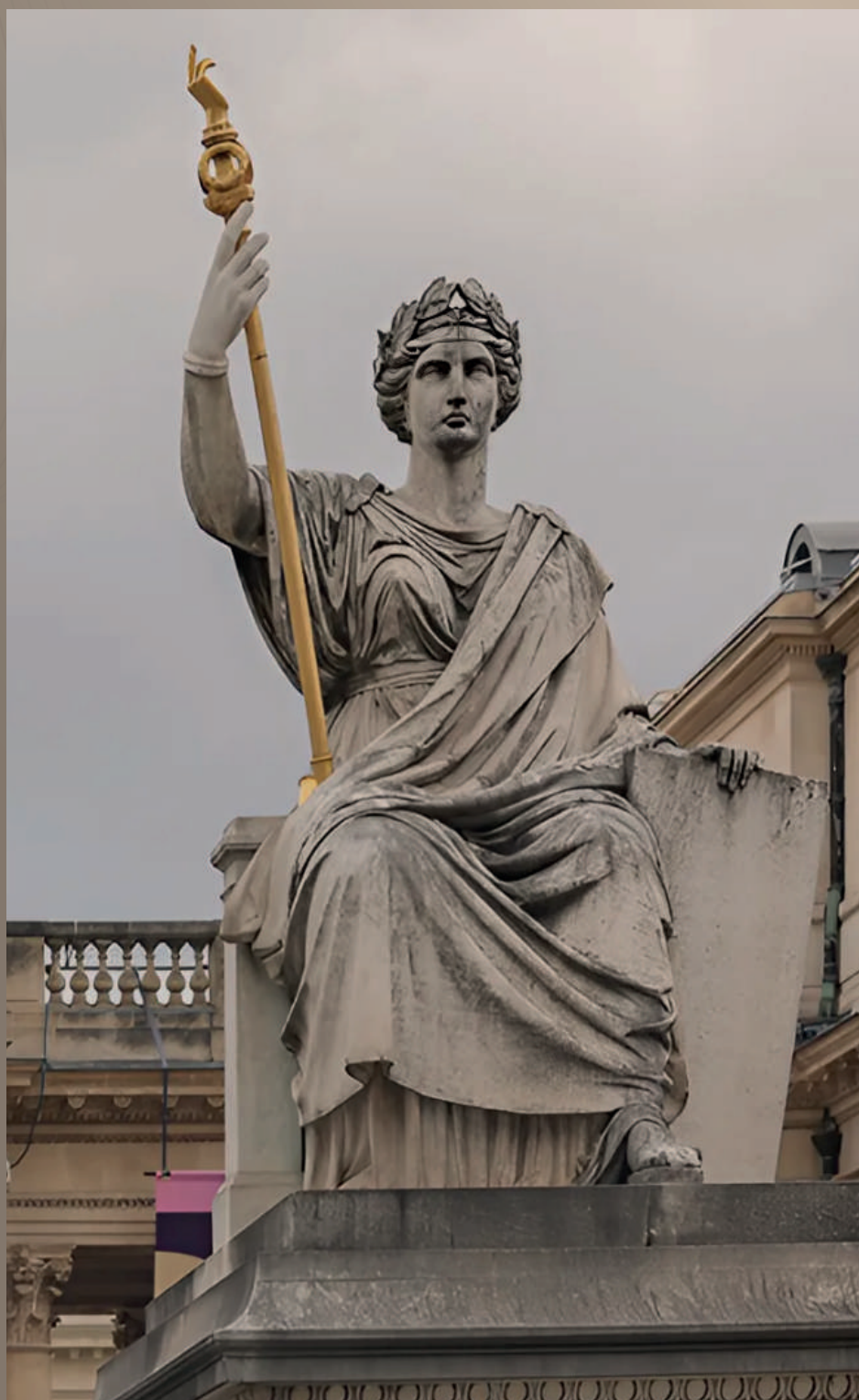
Statue 'Law', Bourbon Palace, Paris, France

CORPORATE INTELLIGENCE AND FORENSICS corporate fraud investigation