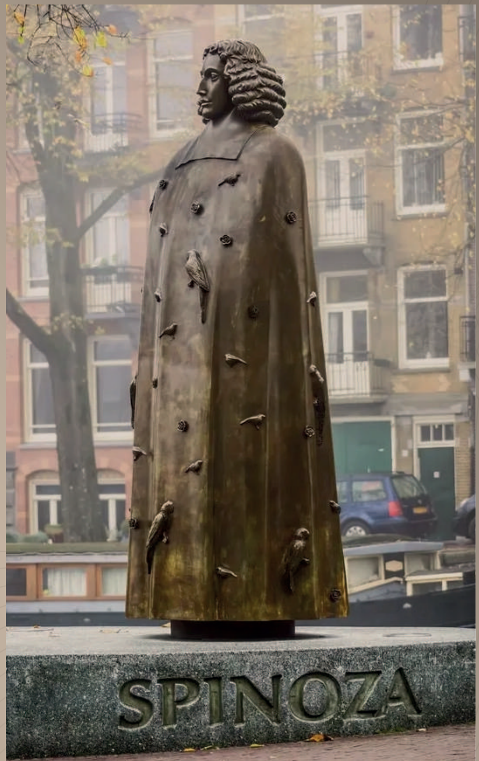
Baruch Spinoza statue, Amsterdam, Netherlands

Supporting your business in the Middle East