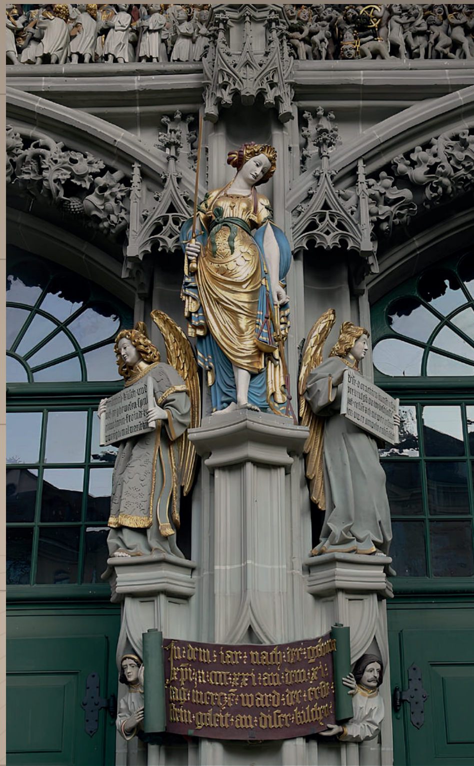
Sculpture "Justice", Bern, Switzerland

external and internal construction financing