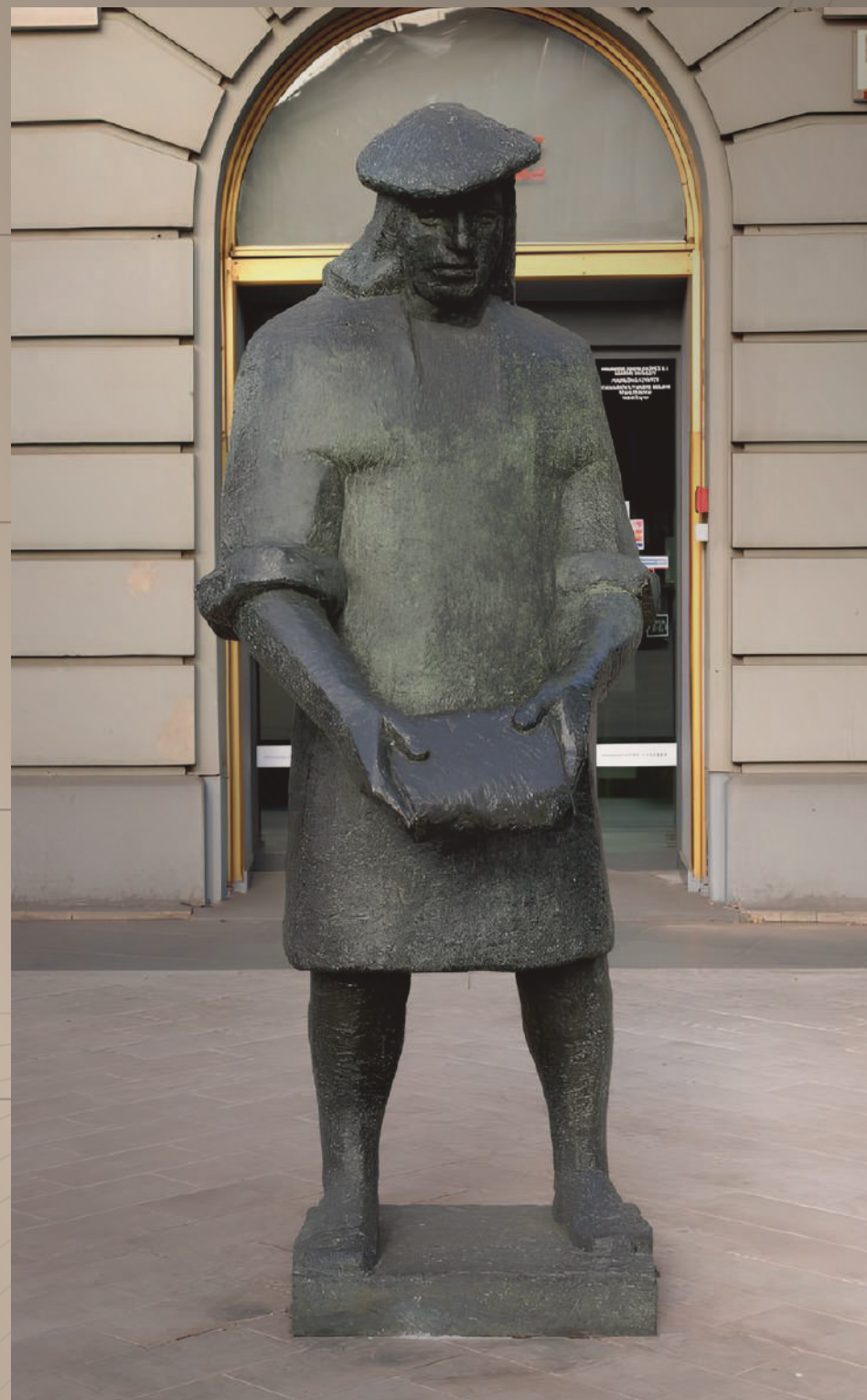
'Benedetto Contrugli' statue, Zagreb, Croatia